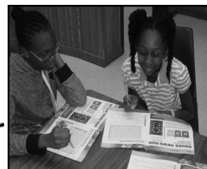
GE is proud to be the signature sponsor for Girls Inc.